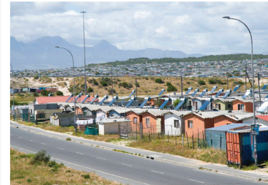
The Kuyasa CDM project entailed the retrofitting of 2,300 homes with solar water heaters, insulation and energy efficient light bulbs.

The community was involved throughout the design and construction process, and all construction workers received training, which was designed such that workers would learn both specific skills and a general problem-solving approach which would be transferable. Components of the building were designed so that they could be supplied by local small enterprises: brick recycling, door and window manufacture, burglar bars, reed ceilings and landscaping were "outsourced" to local enterprises. Material suppliers were assessed for compliance with fair labour practice and support for 'historically disadvantaged' individuals (ie individuals who were discriminated against under the 'apartheid' regime). Technology used was appropriate to the skills level of the community.