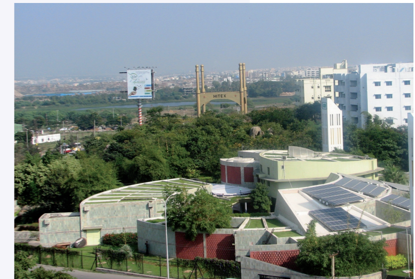
The Confederation of Indian Industry Sohrabji Godrej Green Business Centre received the prestigious LEED Platinum rating in 2003. This was the first Platinum rated green building outside of U.S.A and the third in the world.