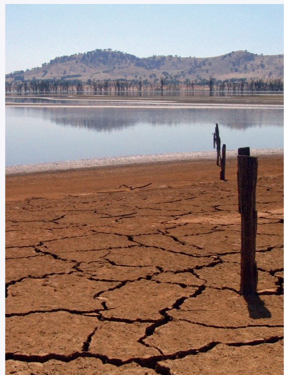
Across Africa and the Middle East, the scarcity of water is a major issue.

Egypt is a country that is experiencing rapid growth. The population is approaching 100 million and this is putting considerable strain on natural resources, public services, housing and infrastructure.