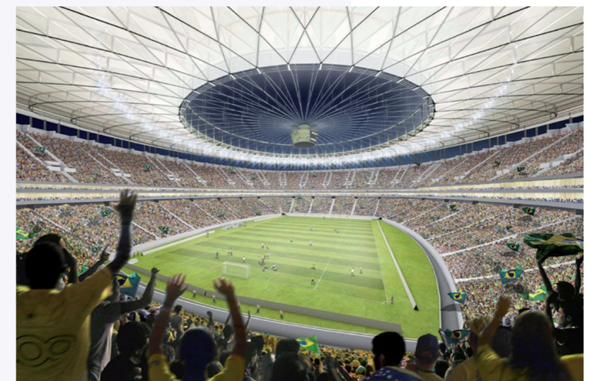
The new National Stadium in Brasilia is currently seeking LEED certification. Credit: Castro Mello Architects