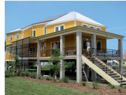
One of many homes being built by Make It Right New Orleans, the post-Hurricane Katrina housing initiative

After Katrina hit New Orleans in 2005, USGBC organized a charrette on Gulf Coast Reconstruction which resulted in The New Orleans Principles – a consensus-based document that identified specific strategies for a sustainable rebuilding effort. The principles represented a consensus among the 160 participants, including residents of New Orleans, along with experts in urban planning, waste and water management, engineering, and architecture. One of the central themes of the Principles was inclusivity; recognizing that local community involvement and investment is at the core of any effort to build or rebuild a city.