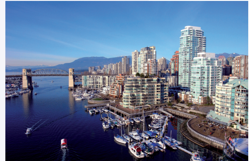
Vancouver Harbor.

While supporting an important social cause, the building also demonstrates excellent environmental performance including a storm water management plan, close proximity to public transportation, and use of locally-sourced and recycled building materials, among other features. In addition, the building was designed such that 90% of the spaces have views to the exterior. The CMHA even initiated a green building education policy with the purpose of educating the residents and visitors of Haven Gardens about the buildings key features and many benefits. 7