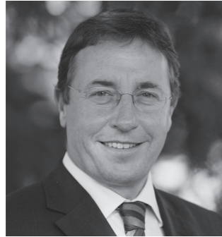
Achim Steiner

“If targets for greenhouse gas (GHG) emissions reduction are to be met, decision-makers must unlock the potential of the building sector with much greater seriousness and vigor than they have to date and make mitigation of building-related emissions a cornerstone of every national climate change strategy. Together, we must raise awareness of the important role of this sector as a priority in meeting national GHG emission reduction targets. We must form national and regional baselines for building-related emissions using a consistent international approach, such as the Common Carbon Metric to measure, report, and verify performance.