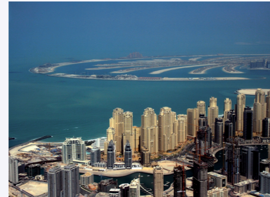
UAE Dubai Marina and Palm.